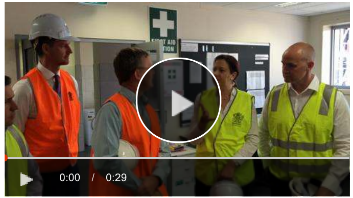
$16 million Northern Oil Refinery project: If successful, the new project will bring 60 full time jobs to the Gladstone region.