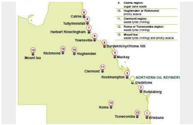
A map of the primary processing plant site.